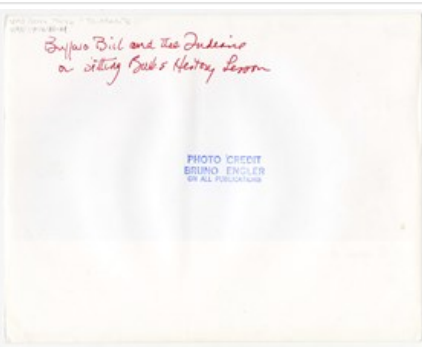
Buffalo Bill and the Indians on sitting Bull's Heavy Lesson