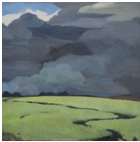
Burning Cane Sugar, Hawaii