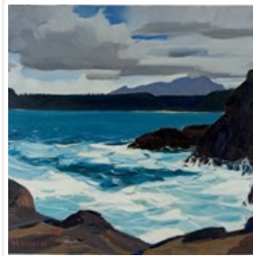
Hanalei Bay, Hawaii