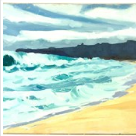
Hanalai - Kauai