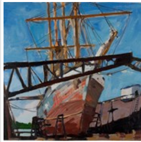
Commodore in Dry Dock, Honolulu, Hawaii