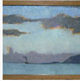
Boat on Ocean, Hawaii