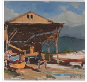
Building Sampans at Kewalo Basin, Hawaii