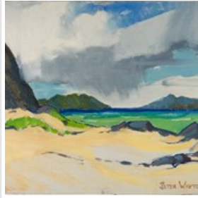
Beach at Makapu'u Point, Hawaii