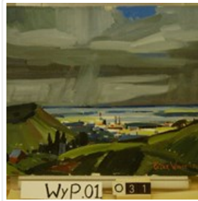
Dole Pineapple Factory, Honolulu