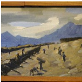
Field Workers, Hawaii