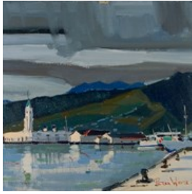
Aloha Tower, Hawaii