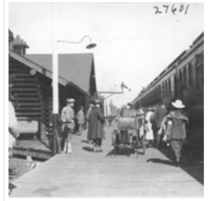
R. R. Station, Lake Louise / 27601