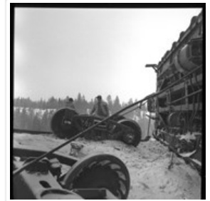
C.P.R. [Canadian Pacific Railway] Train Wreck, 1960