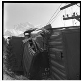
C.P.R. [Canadian Pacific Railway] Train Wreck, 1960