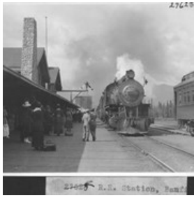
R. R. station, Banff / 27623