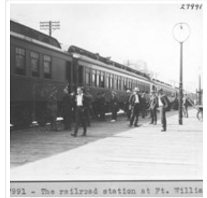
The railroad station at Ft. William / 27991