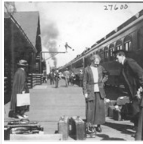
R. R. Station, Lake Louise / 27600