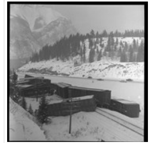
C.P.R. [Canadian Pacific Railway] Train Wreck, 1960