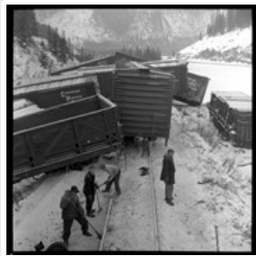
C.P.R. [Canadian Pacific Railway] Train Wreck, 1960