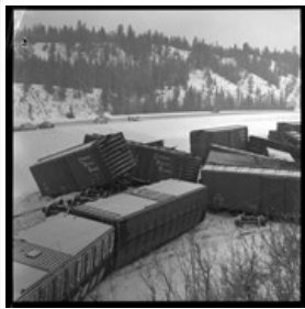
C.P.R. [Canadian Pacific Railway] Train Wreck, 1960