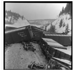
C.P.R. [Canadian Pacific Railway] Train Wreck, 1960