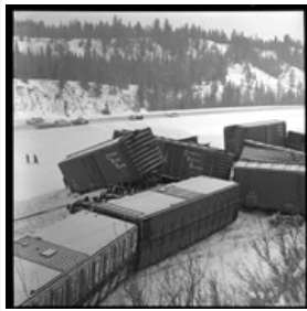
C.P.R. [Canadian Pacific Railway] Train Wreck, 1960