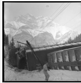
C.P.R. [Canadian Pacific Railway] Train Wreck, 1960