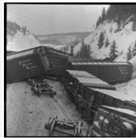
C.P.R. [Canadian Pacific Railway] Train Wreck, 1960