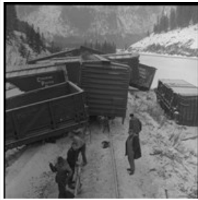
C.P.R. [Canadian Pacific Railway] Train Wreck, 1960