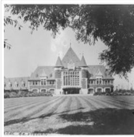
Quebec entrance to the fort / CN-57 Quebec R.R. Station