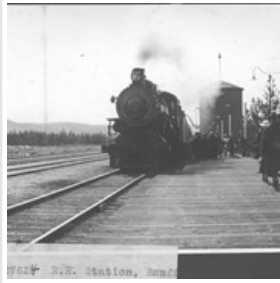
R. R. station, Banff / 27624