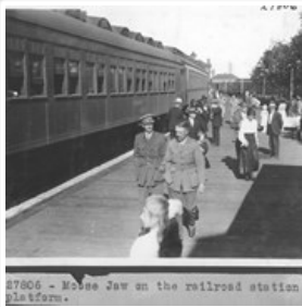
Moose Jaw on the railroad station platform / 27806