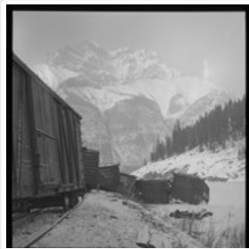
C.P.R. [Canadian Pacific Railway] Train Wreck, 1960