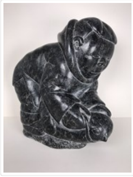
Figure With Bird