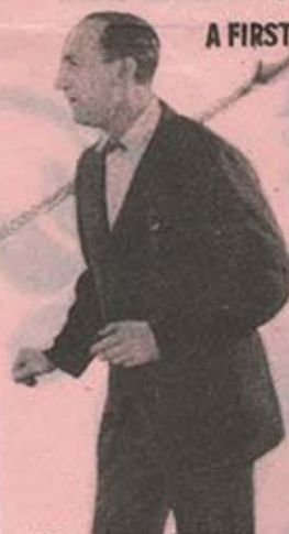
Slippery Eddie - a thief who found some- thing new in life.

James Rennie Dorothy Mackaill Anders Randolph and a great cast