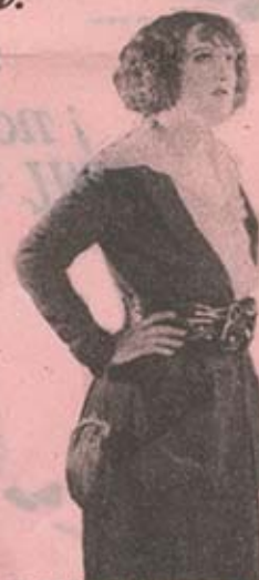
Mollie who tried to fight against the magic melody.