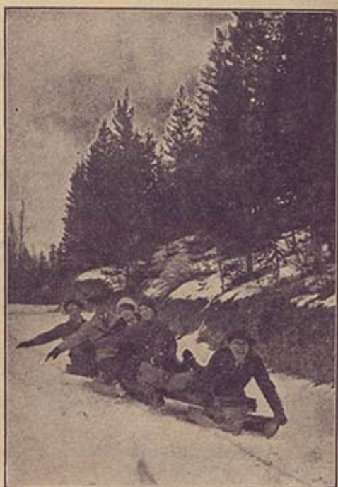
Tunnel Mountain Bob-Sled Run