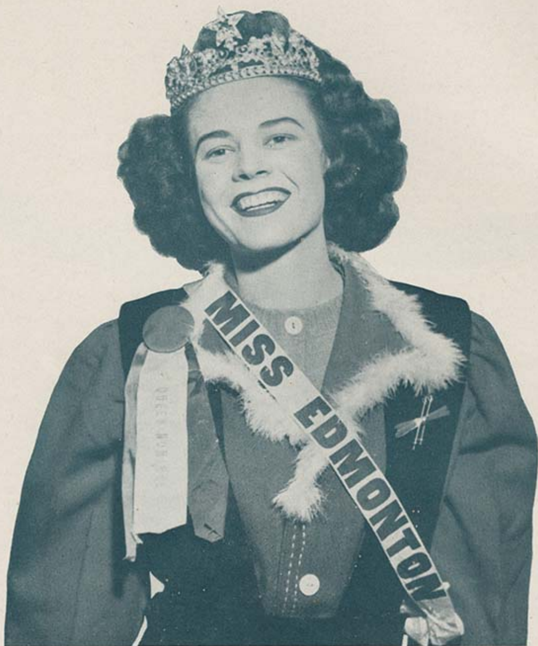
QUEEN MARY 1948

Queen Contest. Nominations for the honor of reigning over the 1949 Winter Carnival are invited. Nominees must attend the 1948 Carnival and will be extended many privileges and given special attention. Judging will be based on personality, sportsmanship and winter sports attire.