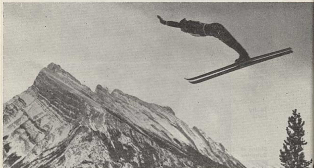
Ski Jumping at Mount Norquay