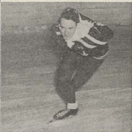
Speed Skating Has Been Feature of The Carnival