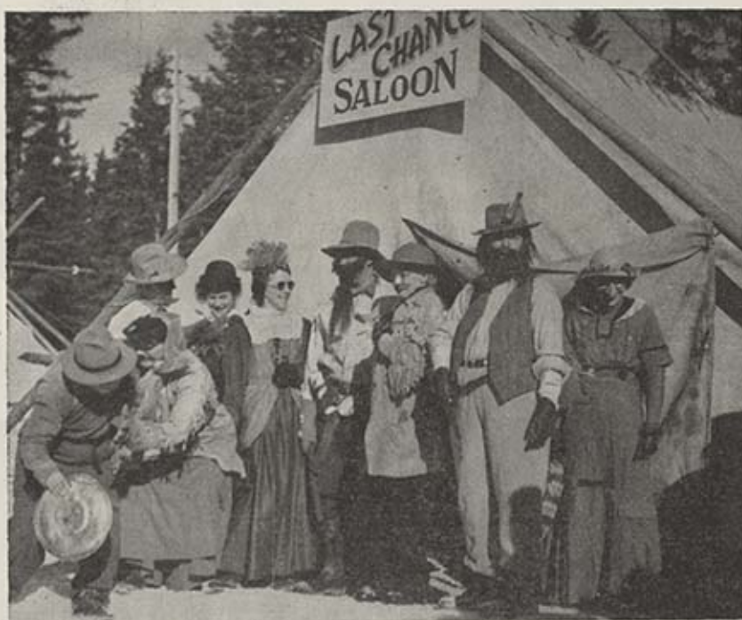
RELICS OF THE FRONTIER DAYS