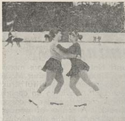
The "Queen" Figure Skates