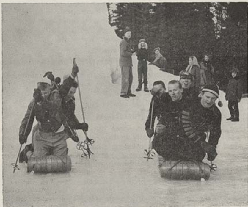
TOBOGGANING IS A MAJOR SPORT