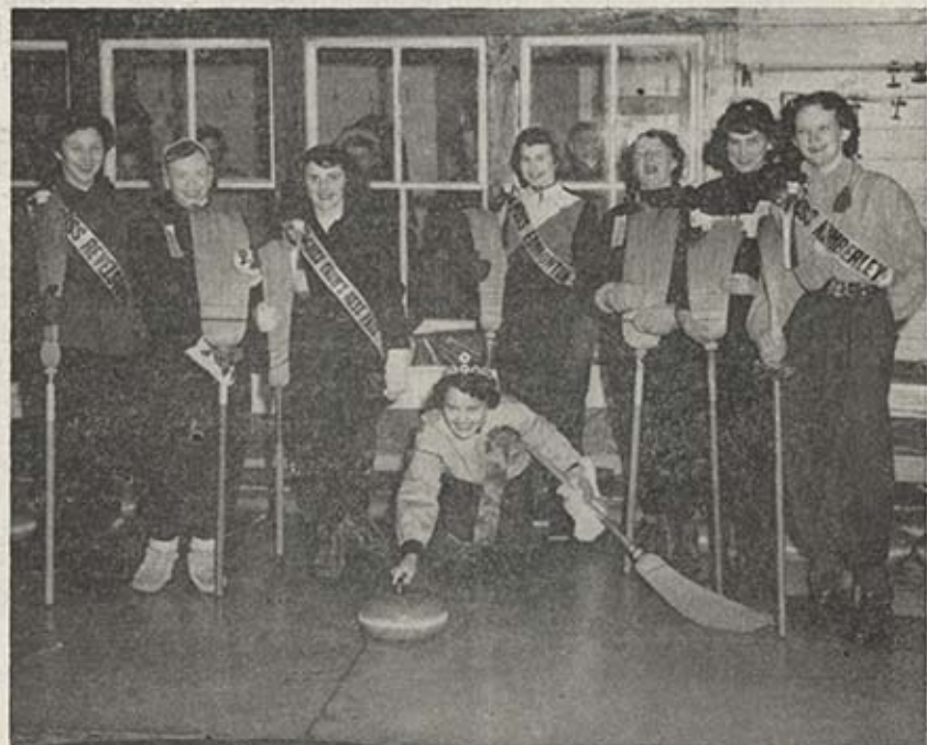
The "Queen" Opens The Carnival Bonspiel