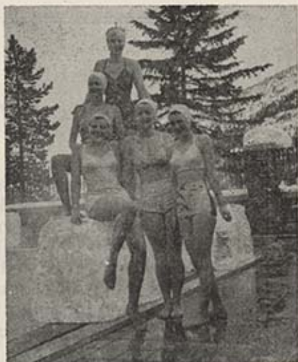
AT THE HOT POOL

Banff in Wintertime offers you Excellent Climate; Perfect Conditions for Winter Sports; Modern Hotels.