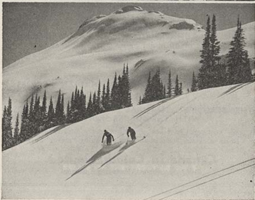
Skiing at Sunshine