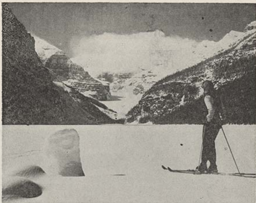
Skiing at Lake Louise