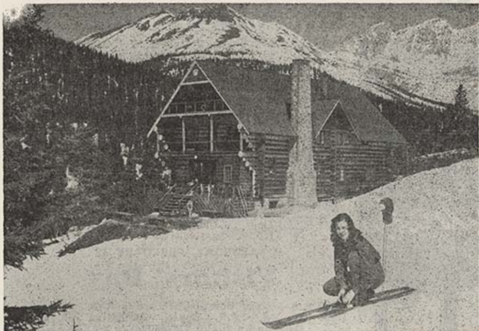
MT. TEMPLE CHALET