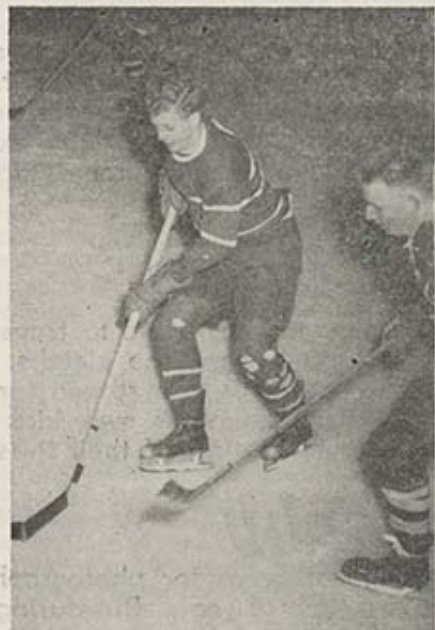
Hockey Attracts Many