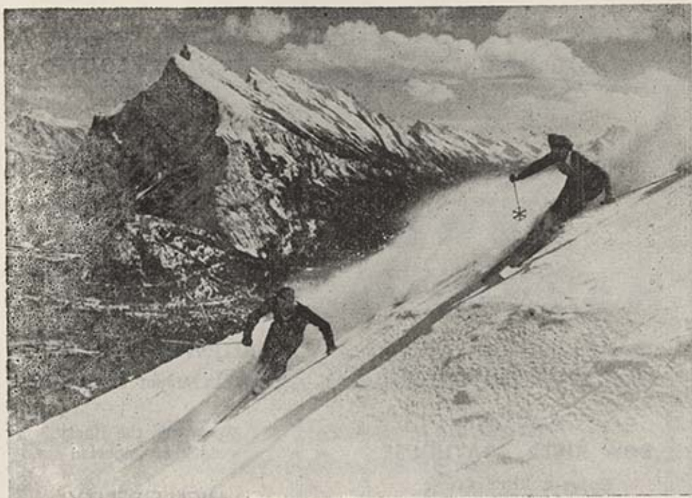
Skiing on Mount Norquay