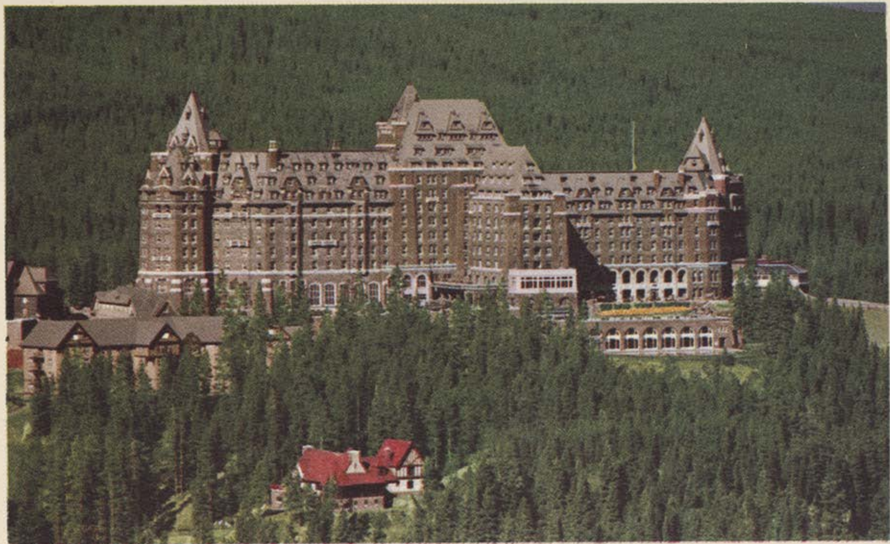
CANADIAN ROCKIES C.P.R. Banff Springs Hotel