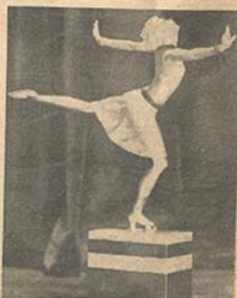
THE SKATER. — A statuette designed as an indoor ornament in bronze and ivory.